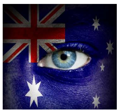
Proud one-eyed Aussie!

Historically Australia has punched above its weight on the world stage in not only innovations and scientific breakthroughs but our sporting success as well. Our unique history and harsh environment have fostered a truly inventive culture of making do with what we have and just getting on with the job. Our country has produced a nation of brilliant, opportunistic and oddball thinkers, tinkerers and titans of industry. Although our nation is ranked as the 55th most populous we are placed 13th for the annual number of patents issued. We consistently manage to figure in the advancement in fields such as agriculture, medicine, mechanics, media and technology. Did you know that Australians