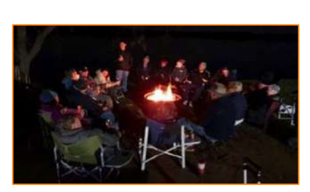
Snug and warm by the fire.