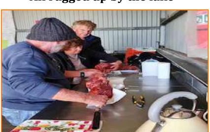
Done to perfection!