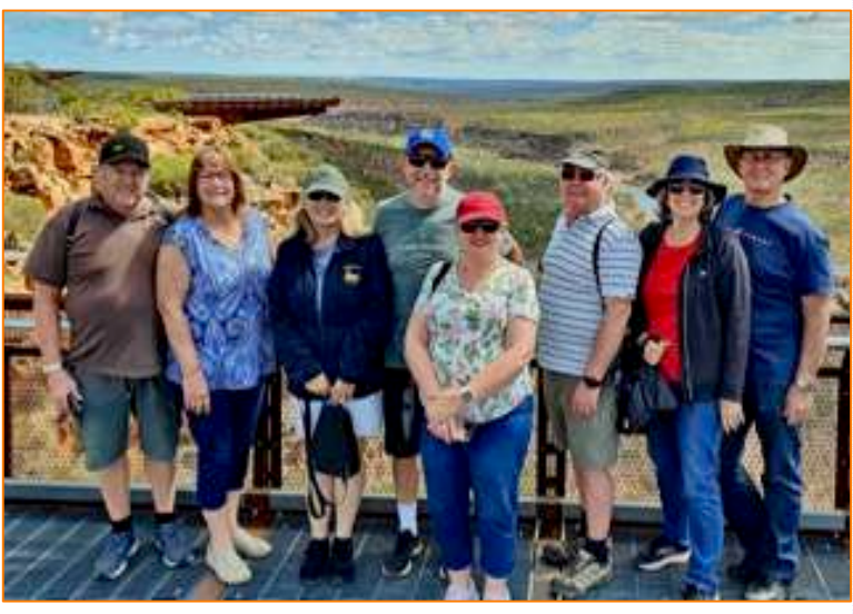
'Splinter Group' Caldwells, Jordans, Moores & Mitchells at the Skywalk in Kalbarri

Some of the highlights included early morning fishing expeditions followed by campfire breakfasts, serious four-wheel driving led by Ron and exploring the many scenic places around Kalbarri. The new Skywalk at the gorges was very impressive as were the cliffs overlooking the ocean. All in all 'a darn good rally' to quote Ian. Certainly sounded like it!