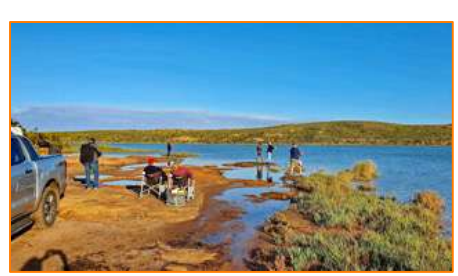
A spot of fishing.