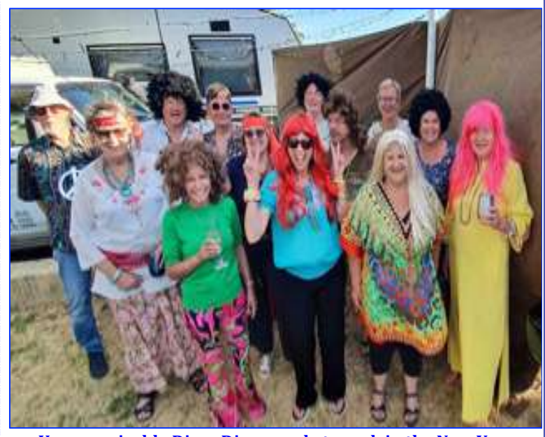
\ \, \textbf{Unrecognizable Disco Divas ready to rock in the New Year.} \\