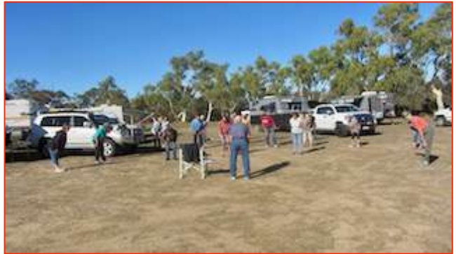
It was great to see everyone joining in all the combined activities from the morning walks, Tai Chi, disc bowls, Finska, golf chipping, ukulele classes and the swap meet. There was never a dull moment.