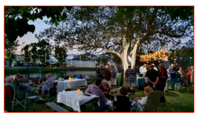
Fairy lights by the lake.